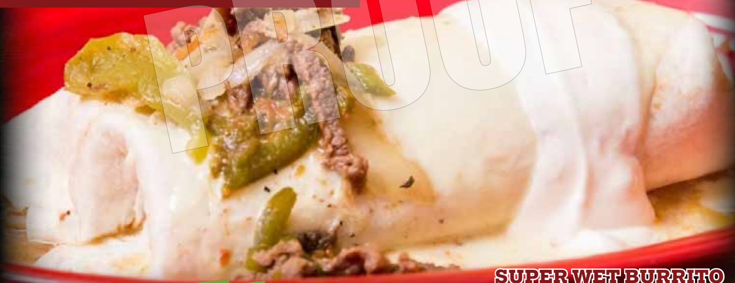
SUPER WET BURRITO

Flour tortilla stuffed with shrimp, scallops, tilapia and crab meat all mixed and chopped with bell peppers, onions and tomatoes. Deep-fried to a golden brown and topped with cheese sauce, lettuce, sour cream, guacamole and pico de gallo. Served with rice and beans - 14.95