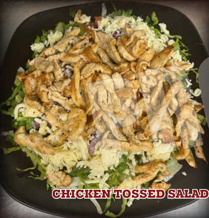
CHICKEN TOSSED SALAD

Beans with cheese dip, chorizo and pico de gallo topped with Cotija cheese - 8.75