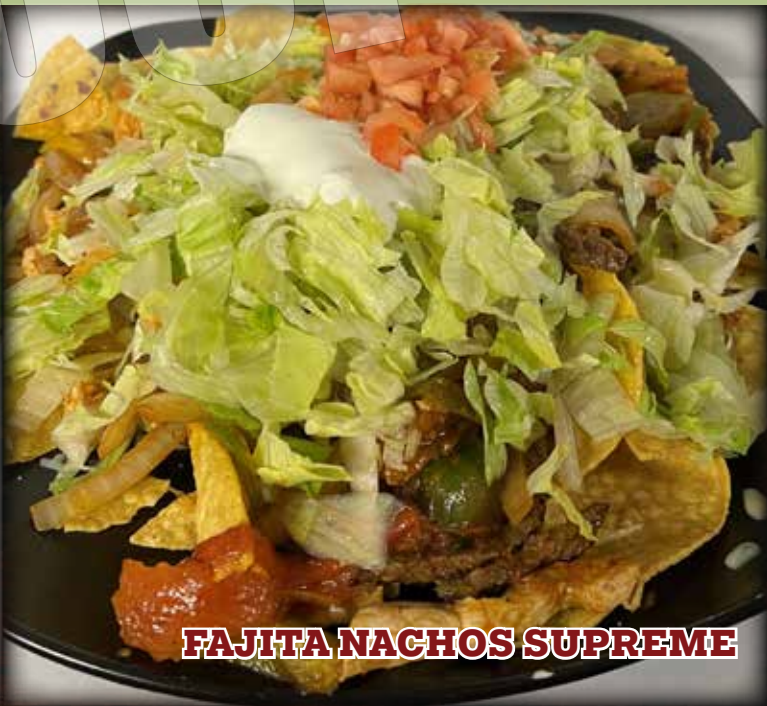
FAJITA NACHOS SUPREME